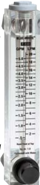
F-550A with Flow Adjustment Valve